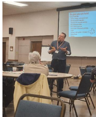
Focus Day Workshop Necessities Essentials Luxuries